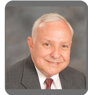
by Rev. Grant Parker

7. Be generous with praise, cautious with criticism. Try to follow the adage: “Praise in public, chastise in private.”