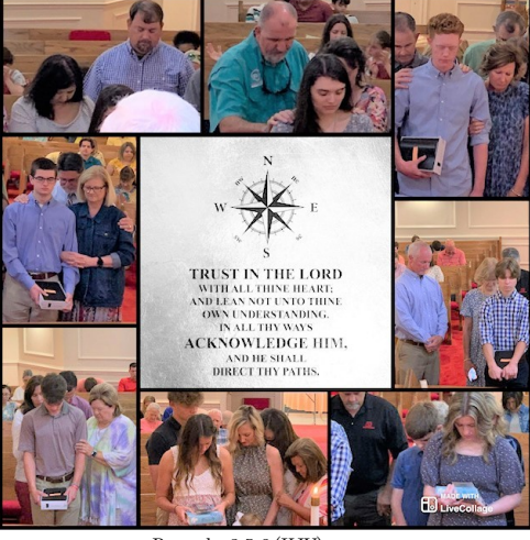
Proverbs 3:5-6 (KJV)